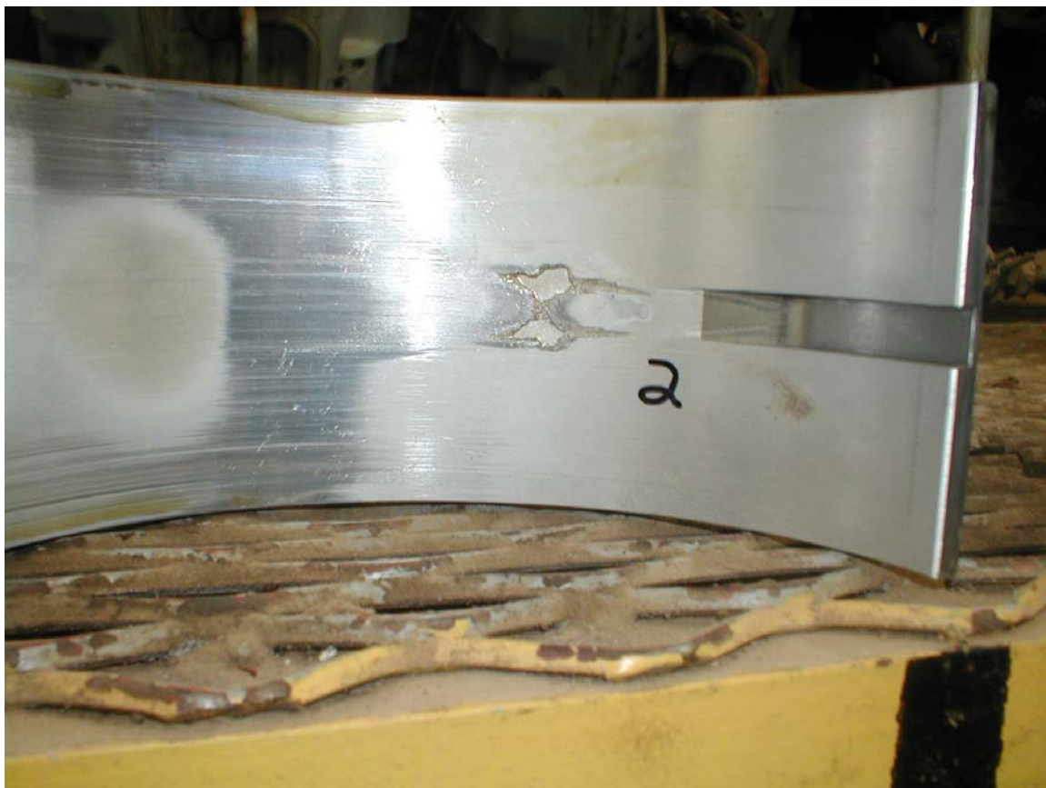
#2 LOWER MAIN BEARING CLOSE UP OF CAVITATION

OBSERVATIONS: SOME DEBRIS MARKS PRESENT CAVITATION AT THE OIL GROOVES .