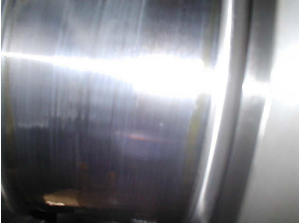
#2 MAIN BEARING JOURNAL NO SIGNIFICANT WEAR FELT ON JOURNAL THERE IS SOME POLISHING AND WEAR MARKS