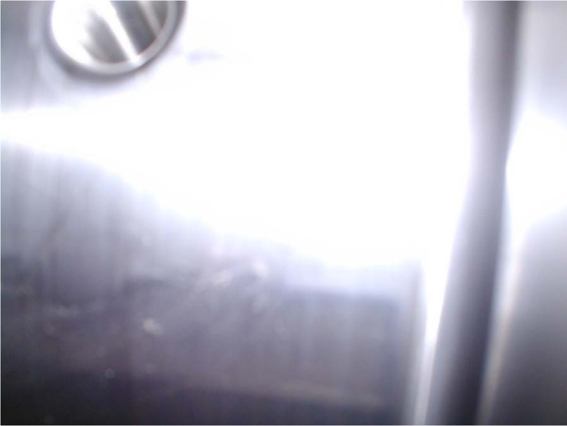
#4 MAIN BEARING JOURNAL