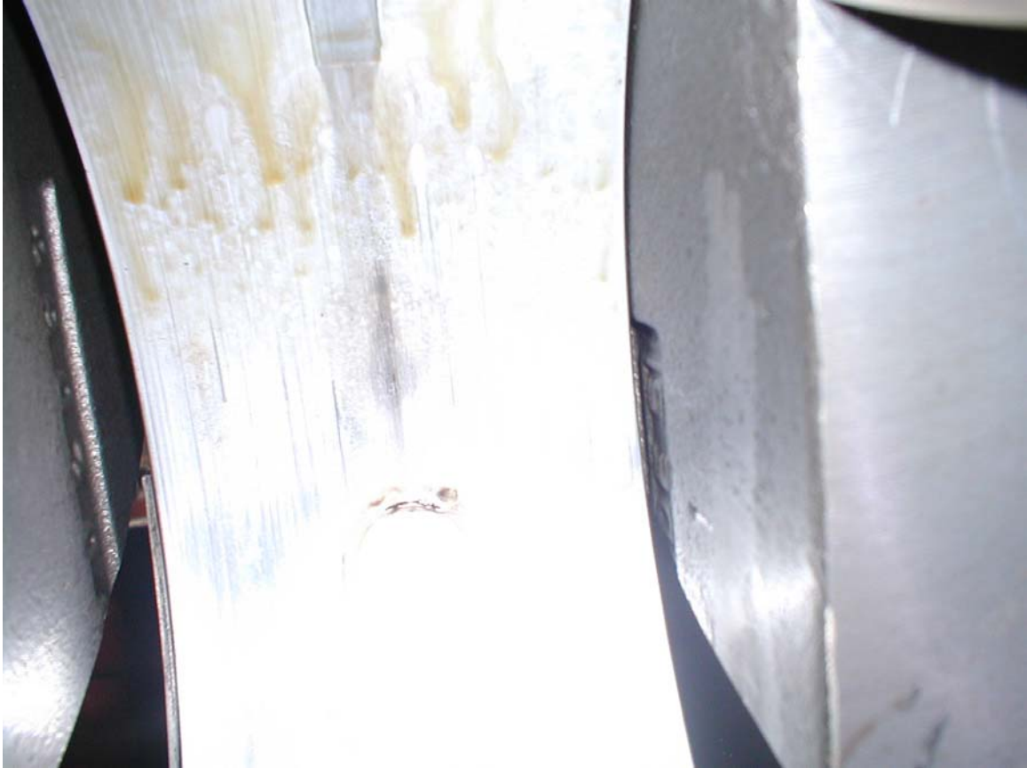
#4 MAIN BEARING DIFFERENT ANGLE