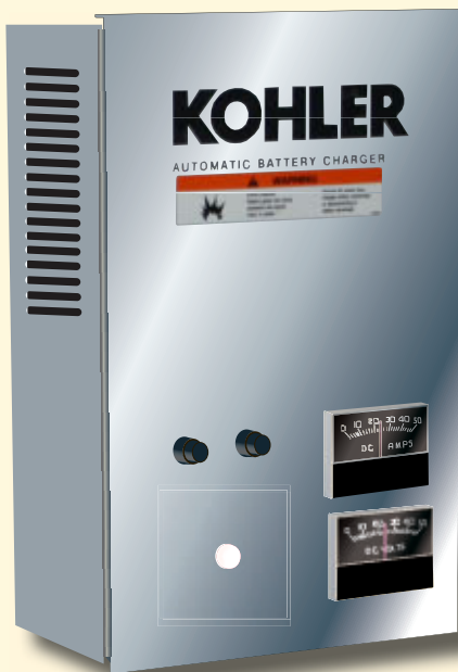
Diagram 2 - Typical Auto Battery Charger